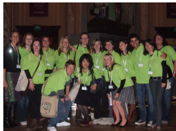
The Green Army

The general conference organisation was highly praised; in particular a positive aspect mentioned was the joint nature of the conference. This is the second joint conference between the British and European societies (the first was held at St Andrews in 2001). Delegates thought that bringing the two together made for a better quality and higher standard of conference and responders commented that they preferred the wider focus of the research. The organising committee and stewards (known as the 'Green Army' because of their distinctive t-shirts) were considered to be very helpful and attentive, and instrumental in creating a friendly environment within the conference.