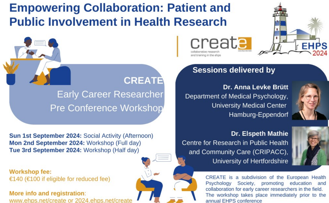
Image 2: Flyer for the annual pre-conference workshop for the EHPS 2024 in Cascais, Portugal.